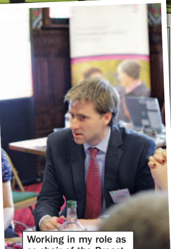
Working in my role as co-chair of the Breast Cancer Group

I support this Government but I have not been afraid to speak out and to vote against it as I did over the issue of whether we should ask the people of this country about the future of our relationship with the European Union.