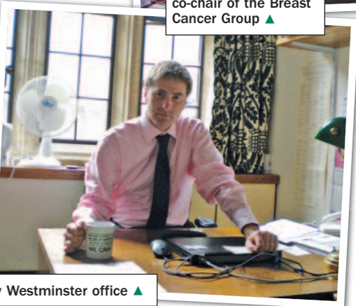
In my Westminster office