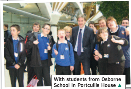
With students from Osborne School in Portcullis House