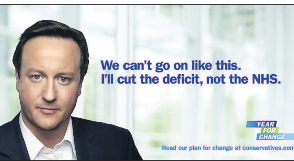
We can't go on like this ... one of the new Conservative billboard adverts featuring David Cameron

As the party of the NHS, we will never change the idea at the heart of our NHS – that healthcare in this country is free at the point of use and available to everyone based on need, not ability to pay. Labour promised to save the NHS but today, despite the massive increase in