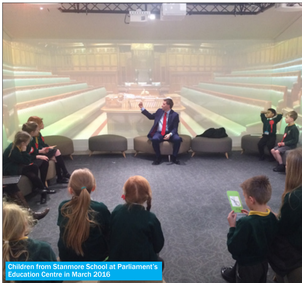
Children from Stanmore School at Parliament's Education Centre in March 2016

"Equally, nobody is complacent and great thought has been given to the