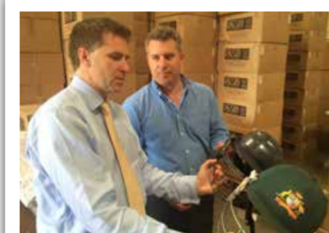
We have world-beating local businesses in this constituency, including leading cricket helmet manufacturer, Masuri, who I visited in June 2016. www.stevebrine.com/masuri