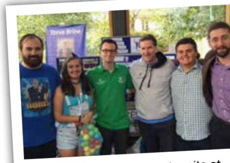
The University of Winchester sits at the heart of our community in so many ways. Alongside the Conservative Student Society I welcome new students to the city each Autumn. www.stevebrine.com/students