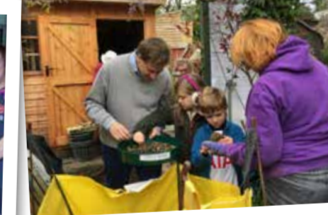
The history of Winchester still excites me and brilliant groups like Hyde900 make it current for the next generation; including at events such as this Community Dig in Hyde. www.hyde900.org.uk