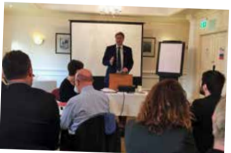
The local business community is very important to me and I try to support it every step of the way; here addressing the Chamber Breakfast in January 2017. www.stevebrine.com/business