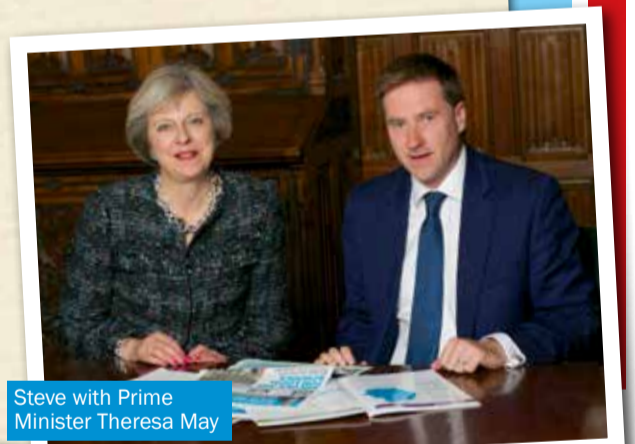
Steve with Prime Minister Theresa May

PS – You can access a wide range of information about my work, locally and in Westminster, at www.stevebrine.com