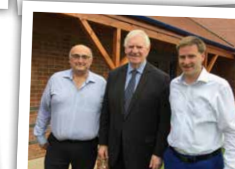
Saints legend, Lawrie McMenemy, dropped into South Wonston last Summer for the opening of their excellent new Pavilion. www.stevebrine.com/SWPavilion