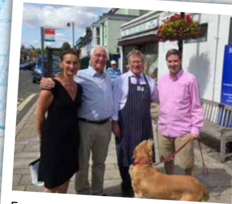
For over a decade now I have held a regular street surgery in Alresford with local councillors and some special guests! www.stevebrine.com/alresford