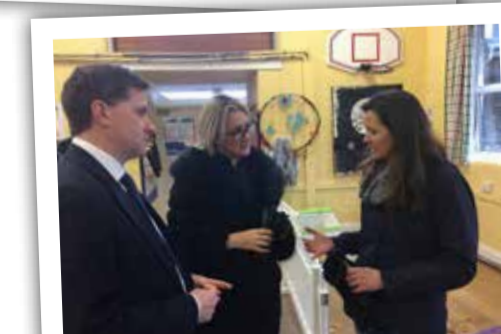
I have brought fellow Government Ministers to the constituency as much as possible; here with Caroline Dinanage talking childcare policy in Fulford earlier this year.