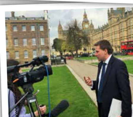
You will often find me speaking up for area via the local (and national) media from the famous College Green in Westminster.