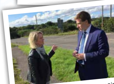
Alongside local councillors I remain fiercely opposed to development on the Pitt Vale site. I will stay focused as we move towards the Public Inquiry this October. www.stevebrine.com/pittvale