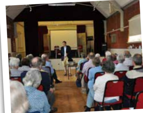
I regularly speak to groups in the constituency; here with the Friends of St Cross Hospital and yes, I am wearing a jacket with shorts!