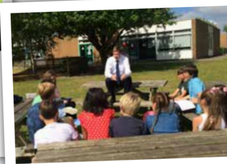
Oliver's Battery Primary School completed a full-set of 'good' or 'outstanding' schools in our constituency in 2016. Here answering questions from the children. #welldonefey