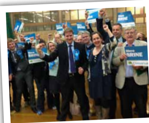
I was re-elected in May 2015 with an increased majority. See more and watch a short film from the count at: www.stevebrine.com/GE2015