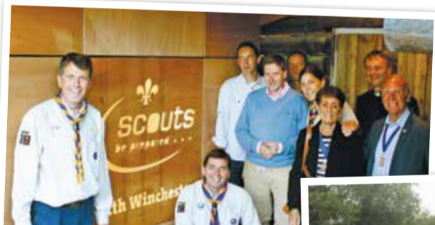
With the Mayor of Winchester and the team at the re-opening of the Scouts Log Cabin in Fulfood.