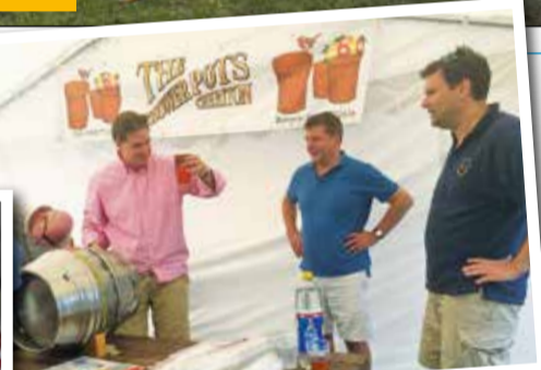
Pulling pints at the Micheldever Fete.