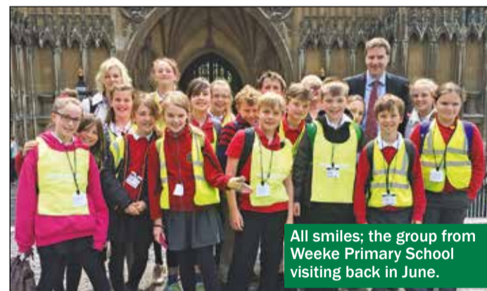
All smiles; the group from Weeke Primary School visiting back in June.

Weeke Primary School in Winchester visited Parliament this Summer continuing Steve Brine's long tradition of welcoming local groups to Westminster.