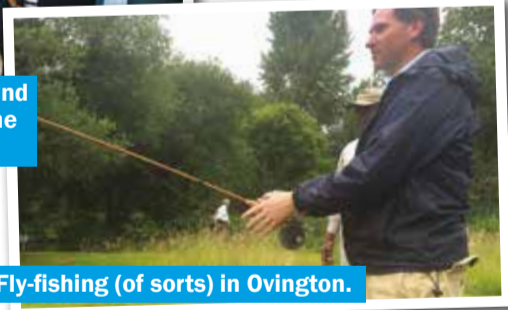
Fly-fishing (of sorts) in Ovington.