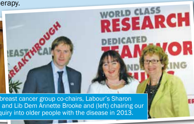
With my breast cancer group co-chairs, Labour's Sharon Hodgson and Lib Dem Annette Brooke and (left) chairing our major inquiry into older people with the disease in 2013.