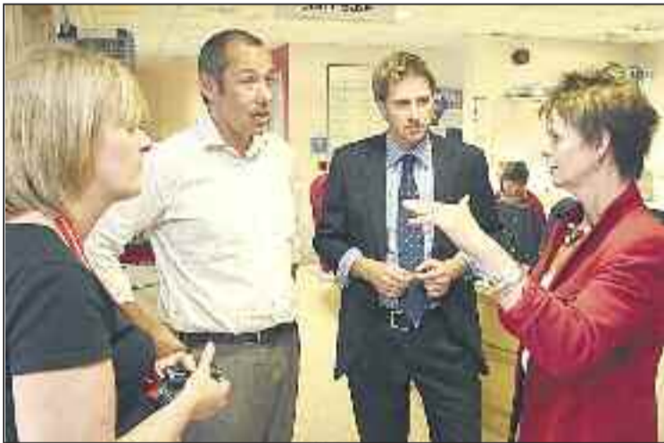
■ Steve brings Shadow Health Minister Anne Milton MP to the Royal Hampshire County Hospital

Prospective Winchester MP Steve Brine and Conservative leader David Cameron have made the NHS their top priority.