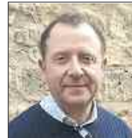
13. Oliver's Battery and Badger Farm