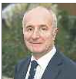
8. St Bartholomew PAUL WING