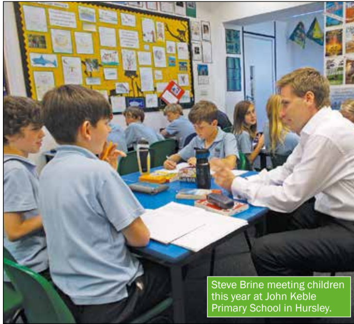
Steve Brine meeting children this year at John Keble Primary School in Hursley.

The MP added that he was continuing to work to make the best of Barton Farm now it is set to be built and revealed he will serve as a Trustee of the new Primary Academy that will come as part