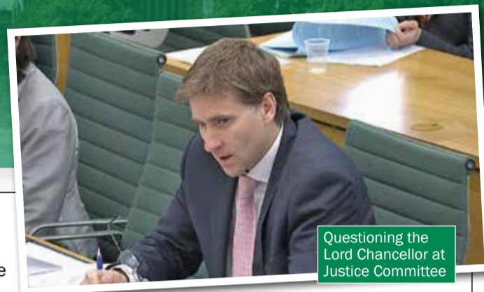
Questioning the Lord Chancellor at Justice Committee