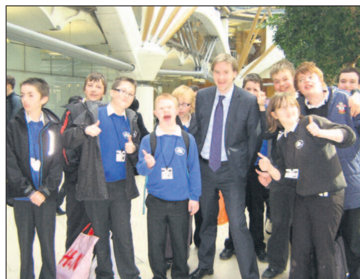
Students from Osborne School in Winchester give a big thumbs up to their day in Westminster.