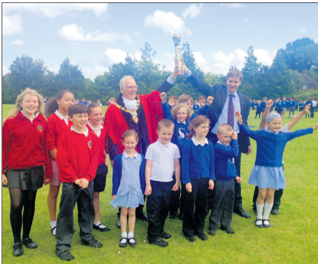
■ The Mayor of Winchester, Cllr Frank Pearson, and Steve Brine MP with (a version of) the Olympic torch and children from Harestock and Weeke primary schools this Summer.

Conservative-led Hampshire County Council has pledged just over £10m to deal with the shortage of primary school places in the city.