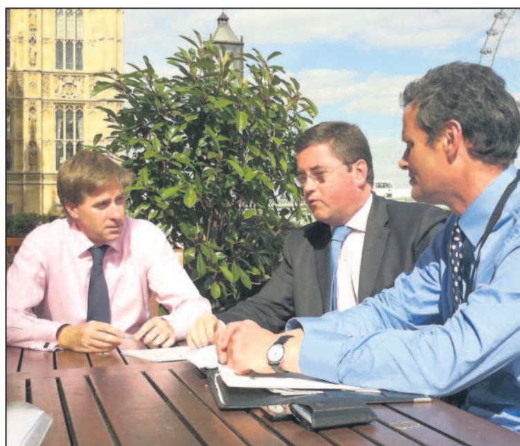
Steve Brine is Vice-Chair of the All-Party Group for Park Homes and is pictured here discussing the new Bill which Steve and his cross-party group of colleagues are backing.