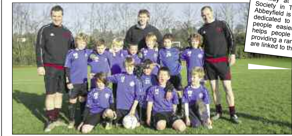
Winchester: Steve Brine took to Chilcomb sports fields to check out the behind-the-scenes progress Winchester Youth FC has recently made. The club, which has links with AFC Bournemouth, Aldershot FC and Eastleigh FC, has around 150 players and an ethos which focuses on providing quality coaching while competing successfully at each age group.