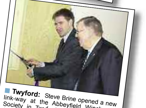
Twyford: Steve Brine opened a new link-way at the Abbeyfield Winchester Society in Twyford in early December. Abbeyfield is a not-for-profit organisation dedicated to making the lives of older people easier and more fulfilling, and providing a range of services, all of which are linked to the local community.

Short-films @ Steve Brine TV www.stevebrine.tv