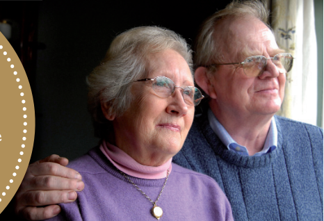
Security and dignity: under Tory plans, pensioners can pay a one-off fee and have all their residential care fees paid for life.

existing insurers and not cost public money, although a Conservative Government will set out basic rules and safeguards.