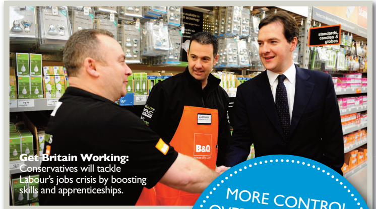
Get Britain Working: Conservatives will tackle Labour's jobs crisis by boosting skills and apprenticeships.

At the same time, Conservatives have revealed plans to boost Britain's budding entrepreneurs