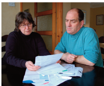
Feeling the pinch: ordinary families are paying the price of Labour's debt crisis

E ven without treats and luxuries, everyday living in the current climate is proving expensive for many people. Politicians must do all they can to reduce the burden. A Conservative Government will take action in a number of ways.