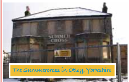
The Summercross in Otley, Yorkshire