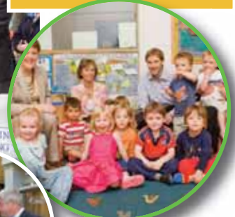
Above: Steve Brine is working with local providers and lobbying Ministers in the face of new proposals that threaten the future of many local nurseries. Pictured here with Hartley House Montessori Nursery and Maria Miller MP.