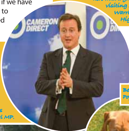
Right: David Cameron visited Winchester last year with his Cameron Direct event in support of Steve Brine and the NHS was one issue raised. Steve says the future of the RHCH will be one of his top priorities as the local MP.