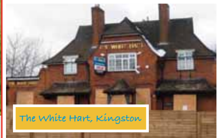
The White Hart, Kingston