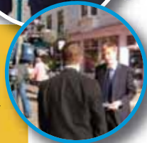
Above: Prospective MP Steve Brine speaking up for our area last Summer on BBC South Today.