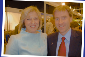
Steve Brine (Top) chatting with local residents about Conservative plans and with Shadow Pensions Secretary, Theresa May.