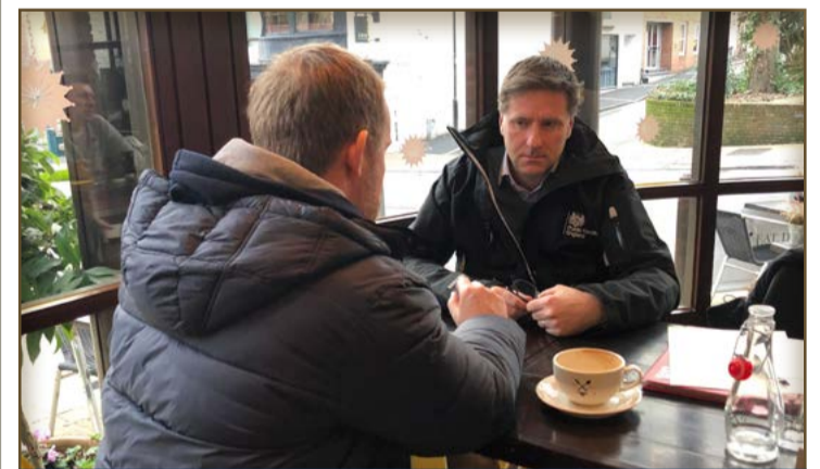
Steve Brine being briefed by Winchester’s Chief Inspector recently.

In addition, as part of ongoing work to tackle serious violence, the Government will urgently review a pilot which makes it simpler for officers to use stop and search powers, with a view to rolling this out across all forces, including Hampshire.