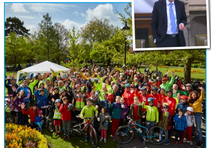
The Cycle Winchester group at Abbey Gardens and, inset, speaking in the cycling debate in the House of Commons.