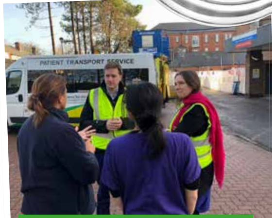
Chatting with staff at the new A&E in Winchester

The local NHS remains my priority. Like my constituents, my family and I rely on it. As an experienced former health minister I hope I understand the NHS and how to support local services. In recent years I've been able to deliver major new investment for Winchester Hospital and that is to our advantage of course.