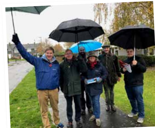
The (Winter) election team out and about

Absolutely. This job takes a lot, and our families know that more than most, but it's a job where you can change things and if you're lucky - as I have been - you can serve in Government and do even more. If the public knew more about the day to day work of MPs they'd have a much higher opinion of us than perhaps is the case today.