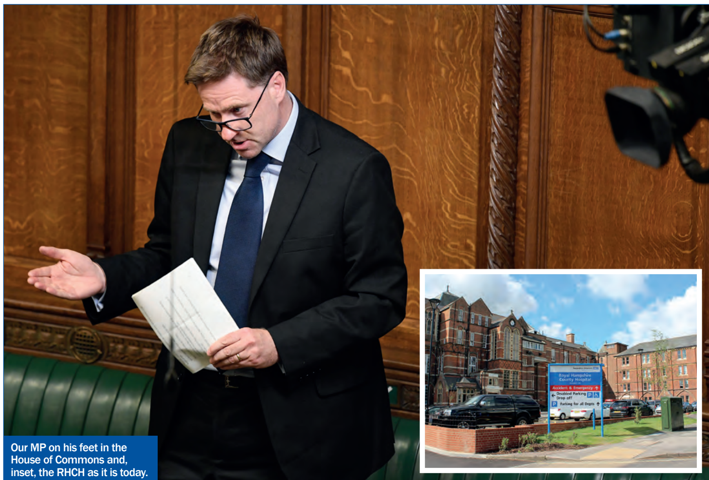
Our MP on his feet in the House of Commons and, inset, the RHCH as it is today.

"But, as I promised at the election, it will also see "significant investment" at the RHCH and I am clear