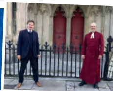
Out in Alresford, the Watercress Line weren't left out. Some £600k will fill the gap travellers have left behind and help keep their engineers/apprentices in employment.