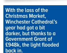
With the loss of the Christmas Market, Winchester Cathedral's year had got a bit darker, but thanks to a Government Grant of £948k, the light flooded back in.