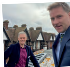
A much needed grant of £219k was given to the Theatre Royal, who even with massive community support, were on a knife-edge. Both the grant and donations have helped secure its future.

Cultural gems and heritage organisations across the area receive over £2m of lifesaving pandemic funding.