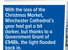
With the loss of the Christmas Market, Winchester Cathedral's year had got a bit darker, but thanks to a Government Grant of £948k, the light flooded back in.