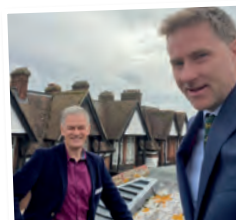
A much needed grant of £219k was given to the Theatre Royal, who even with massive community support, were on a knife-edge. Both the grant and donations have helped secure its future.

Cultural gems and heritage organisations across the area receive over £2m of lifesaving pandemic funding.