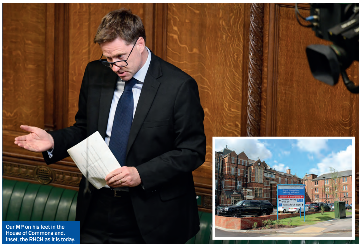
Our MP on his feet in the House of Commons and, inset, the RHCH as it is today.

"But, as I promised at the election, it will also see "significant investment" at the RHCH and I am clear