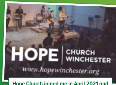
Hope Church joined me in April 2021 and enjoyed a virtual tour followed by Q&A.

Every year I welcome a wide range of groups to Westminster but, this year, it's been a little different. My Virtual Visit Westminster events have proved really popular and you can still join in. Here's a selection with more details to be found at www.stevebrine.com/visitingwestminster