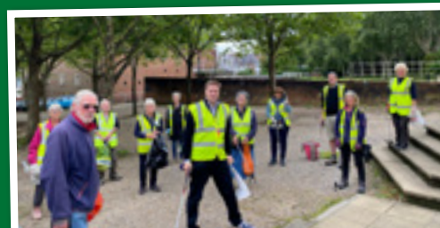
Last Summer I joined the Winchester Litterpickers to help clean up our city centre.