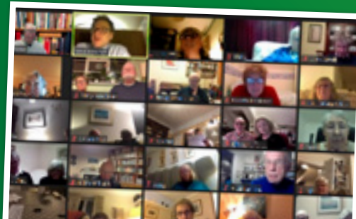
We started the series in January with a large group from the Friends of Winchester Cathedral.