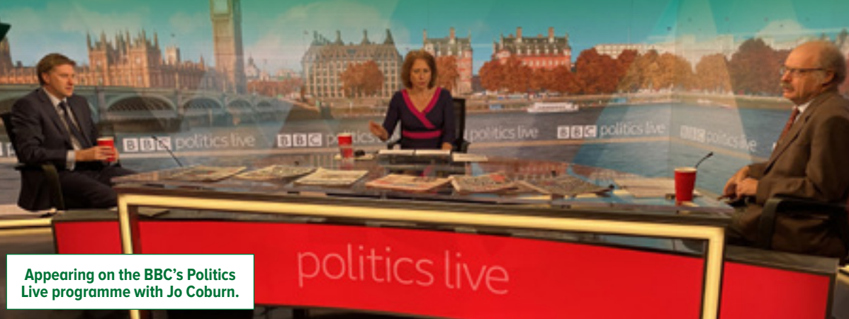
Appearing on the BBC's Politics Live programme with Jo Coburn.

Much else has taken place; with our climate change agenda, education and on domestic abuse as well as internationally, around Russia/China and scrutinising future trade deals.