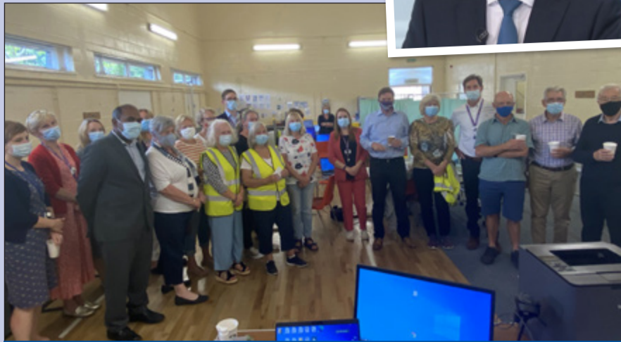
Steve recently joined clinicians from the Winchester City team at the Badger Farm vaccination centre to thank volunteers for their service; and (inset) Secretary of State, Sajid Javid.

Steve Brine says; "The whole NHS and volunteer team have done an amazing job. We know the Covid vaccines are giving around 95% protection against severe disease, so we need to trust the science and learn to live with this virus. We also need to super-charge the booster programme and I am working to address access to that in our area."