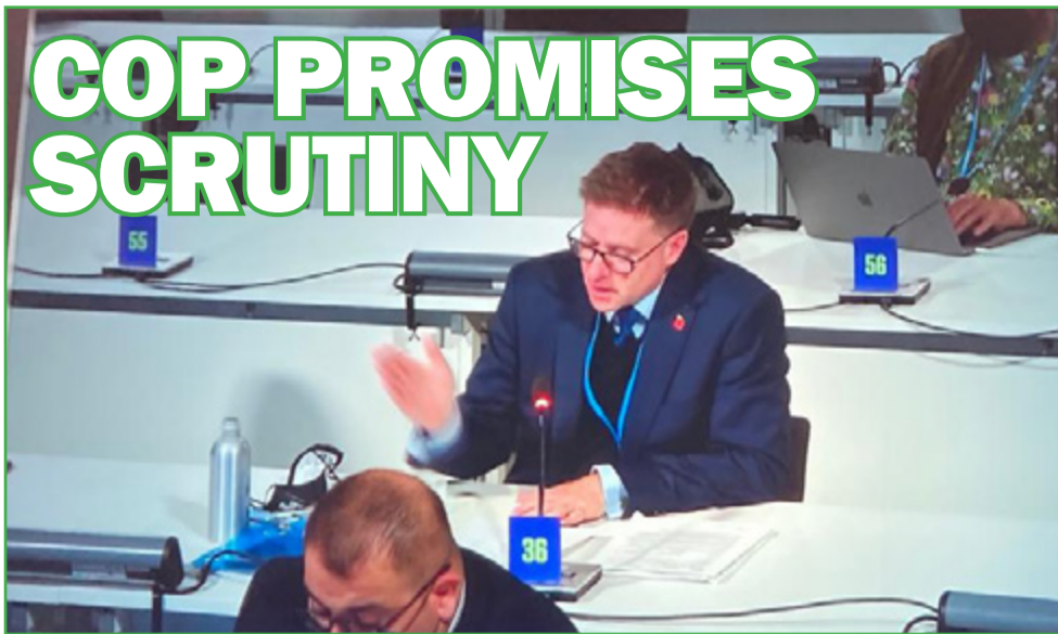
Steve addressing delegates from the UK seat at COP26.

Our MP spoke at a special UN session in Glasgow on the role of Parliaments around the world in scrutinising climate and nature policy. He said; "The commitments are vital, and we should not be cynical about them, but delivery is what it's all about now."