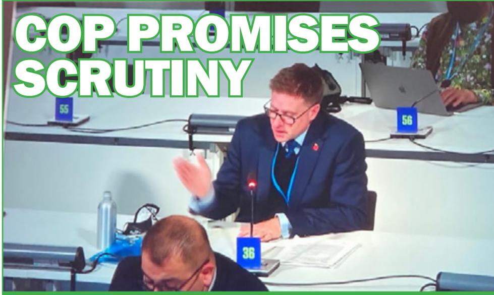
Steve addressing delegates from the UK seat at COP26.

Our MP spoke at a special UN session in Glasgow on the role of Parliaments around the world in scrutinising climate and nature policy. He said; "The commitments are vital, and we should not be cynical about them, but delivery is what it's all about now."