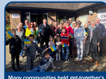
Many communities held get-togethers for our Ukrainian friends including the Colden Common Neighbourhood Group in October.