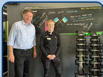
Energie fitness gym in Winchester offered free membership to local Ukrainian guests.