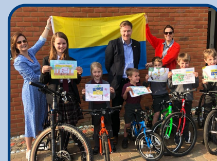
Westgate students organised a sponsored cycle on the Isle of Wight to raise money for the Disaster Emergency Committee (DEC) appeal.

Conservative Hampshire County Council recently announced that residents hosting Ukrainian guests as part of the 'Homes for Ukraine' Scheme will receive an extra £200 per month on top of the £350 from central Government.