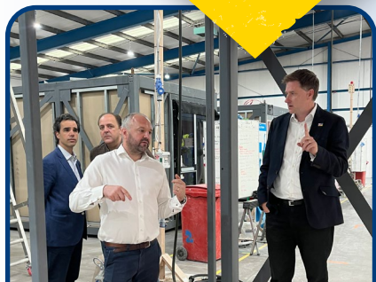
A local property firm, Rehaus, built emergency shelter units to send to the Polish-Ukrainian border.