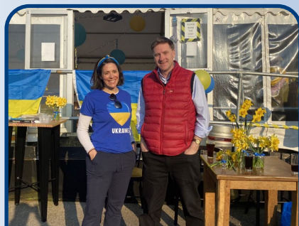
A fundraiser in Twyford, at the Bugle Pub, raised around £8,000 for the DEC appeal in March.