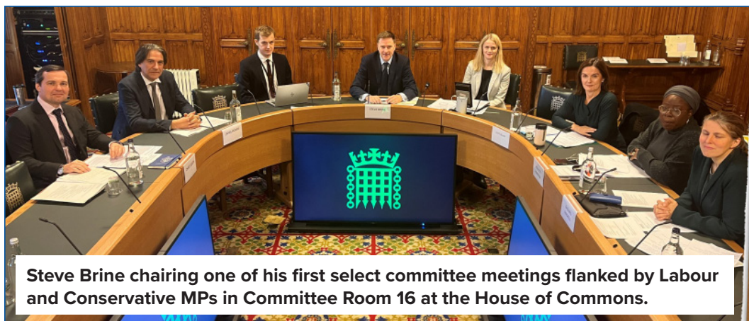
Steve Brine chairing one of his first select committee meetings flanked by Labour and Conservative MPs in Committee Room 16 at the House of Commons.

This year in Westminster promises to be busy, but (we hope) busy with policy debate not personality fever. Nowhere is that debate more alive right now than in the area of health and our MP is at the heart of it.