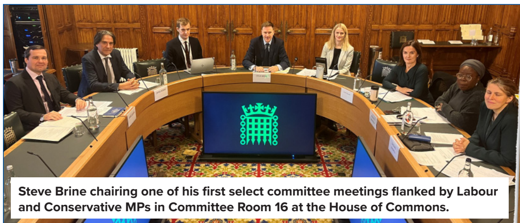
Steve Brine chairing one of his first select committee meetings flanked by Labour and Conservative MPs in Committee Room 16 at the House of Commons.

This year in Westminster promises to be busy, but (we hope) busy with policy debate not personality fever. Nowhere is that debate more alive right now than in the area of health and our MP is at the heart of it.