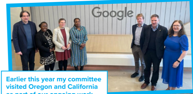
Earlier this year my committee visited Oregon and California as part of our ongoing work.